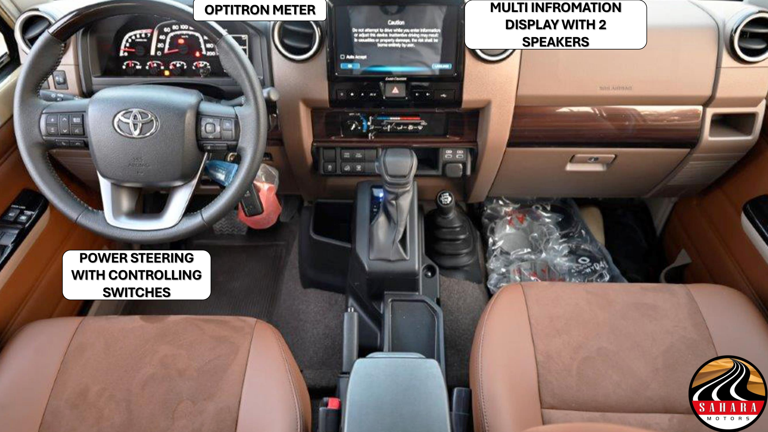
POWER STEERING WITH CONTROLLING SWITCHES